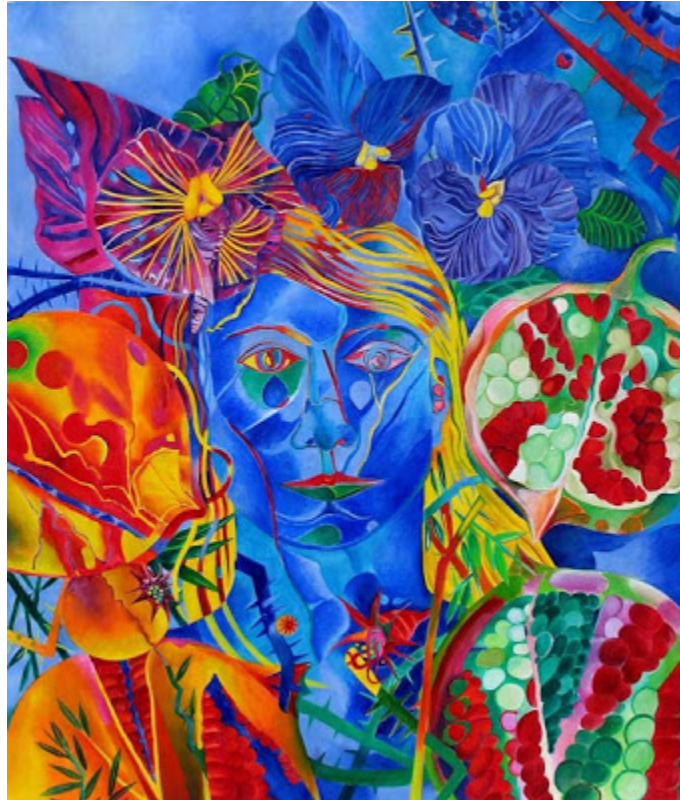
Self-Portrait with Pomegranate, oil on canvas, 51" x 43".

Artwork is copyright protected by the artist. All rights reserved. Do not reproduce without the artist's permission.