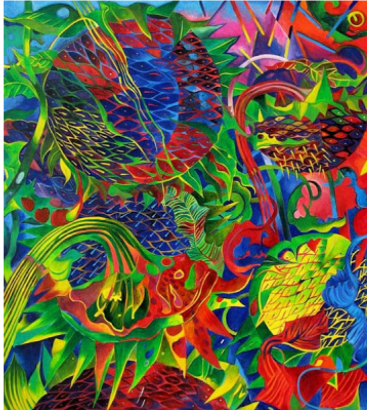
Sunflowers, oil on canvas, 45" x 41".

Artwork is copyright protected by the artist. All rights reserved. Do not reproduce without the artist's permission