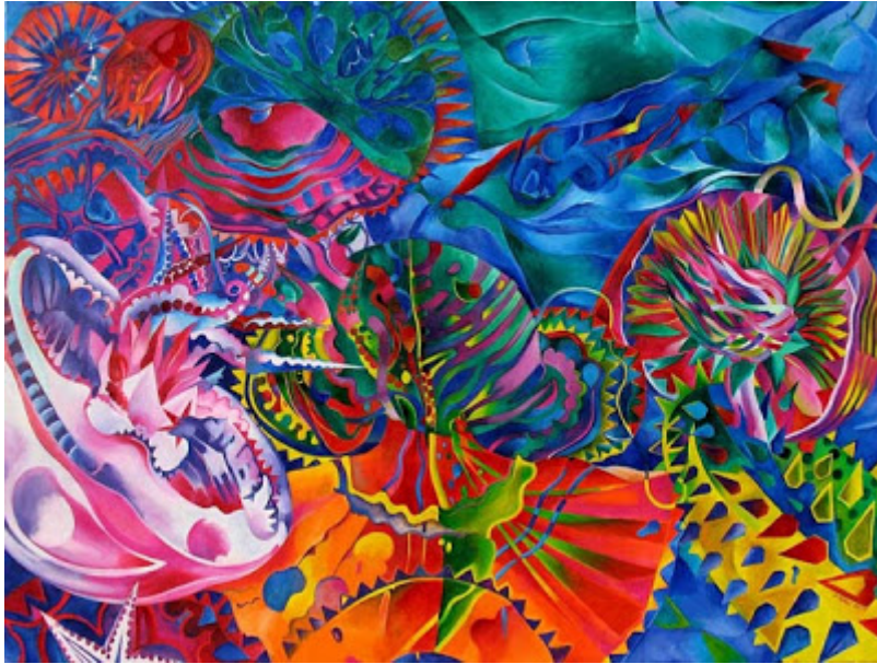
The Swimmer, oil on canvas, 53" x 71".

Artwork is copyright protected by the artist. All rights reserved. Do not reproduce without the artist's permission.