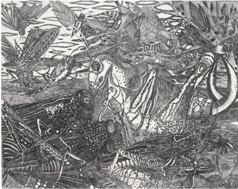
Invasion, etching on zinc, 16" x 20".

Artwork is copyright protected by the artist. All rights reserved. Do not reproduce without the artist's permission.